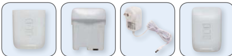
Controller With Built-In Radio Receiver

The PowerSmart™ system includes a controller, removable battery and PowerSmart™ charger.