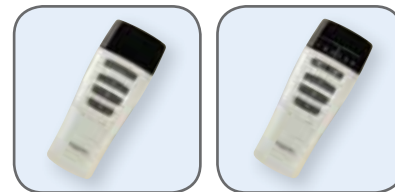
1 Channel Transmitter

Transmitters are powered by a 3 Volt Lithium button battery.